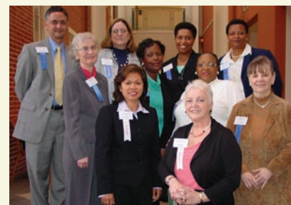
(above) The first Distinguished Lectureship on Diversity in Nursing is held at Thomas Edison State College.