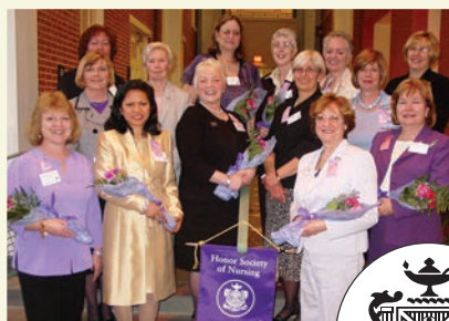
(above) Nursing staff, students and mentors celebrate the charter ceremony for Upsilon Rho, the Thomas Edison State College chapter of Sigma Theta Tau International, held in 2008.