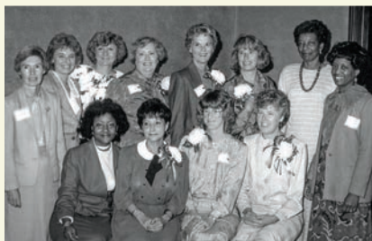
(above) The first graduates of the BSN program at a College reception.