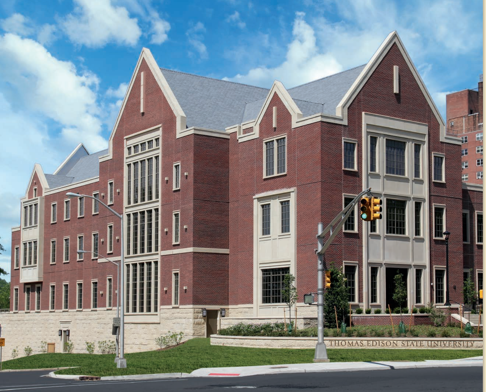
Glen Cairn Hall, home of the W. Cary Edwards School of Nursing at Thomas Edison State University