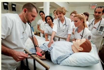
(above) Accelerated 2nd Degree BSN Program students in the University's nursing simulation laboratory.