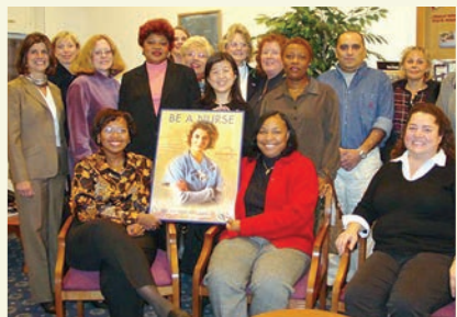
(above) Nursing students and alumni participate in the The National League for Nursing Accrediting Commission (NLNAC) site visit.