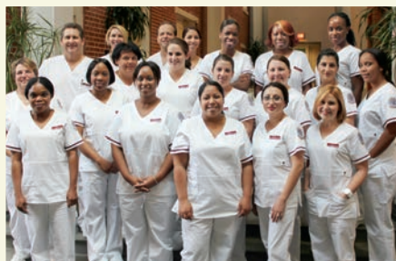
(above) The inaugural class of the Accelerated 2nd Degree BSN Program.