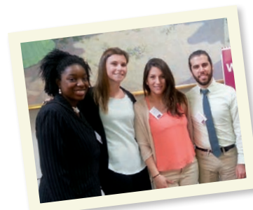
(above) NCIN Scholars, April 2015.