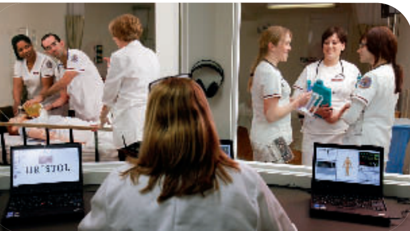
Nurse educators bring the simulators to life in the Simulation Laboratory's control room, where they also observe students responding to a variety of scenarios they will experience with live patients.

grateful to all of the businesses, organizations and individuals whose generous donations made our new lab a reality."