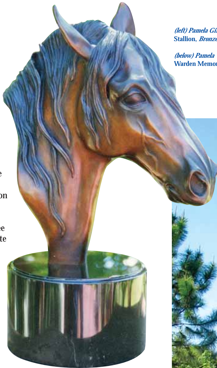
(left) Pamela Gilbreth Watkins' Andalusian Stallion, Bronze, 15" x 10" x 6"